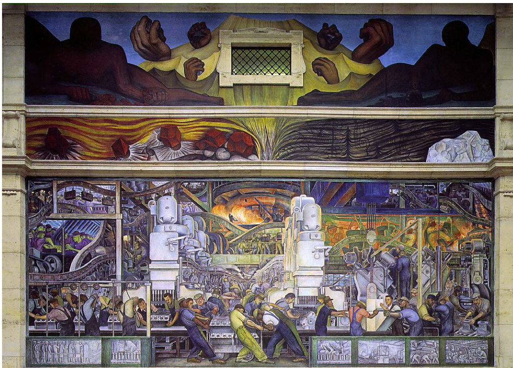
Diego M. Rivera, "Detroit Industry, North Wall," 1932-33 (Detroit Institute of Arts)

THURSDAY, NOVEMBER 6TH TO SATURDAY, NOVEMBER 8TH DOUBLETREE SUITES BY HILTON DETROIT DOWNTOWN – FORT SHELBY 535 W. LAFAYETTE BOULEVARD DETROIT, MICHIGAN